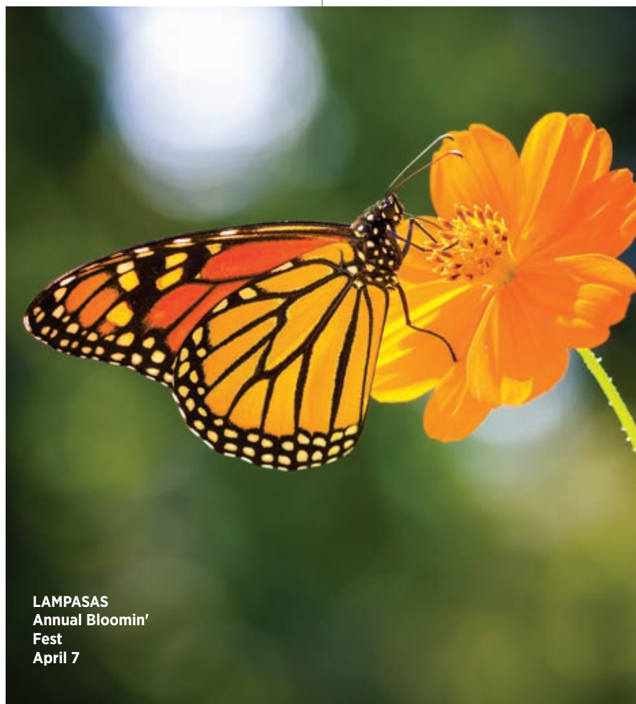
LAMPASAS Annual Bloomin' Fest April 7