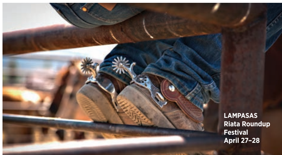
LAMPASAS Riata Roundup Festival April 27–28

Lampasas County Museum, Fridays and Saturdays, 10 a.m.–4 p.m., 303 South Western Ave., between Second and Third streets. Learn about the history of Lampasas County through permanent displays and special exhibitions. Free of charge.