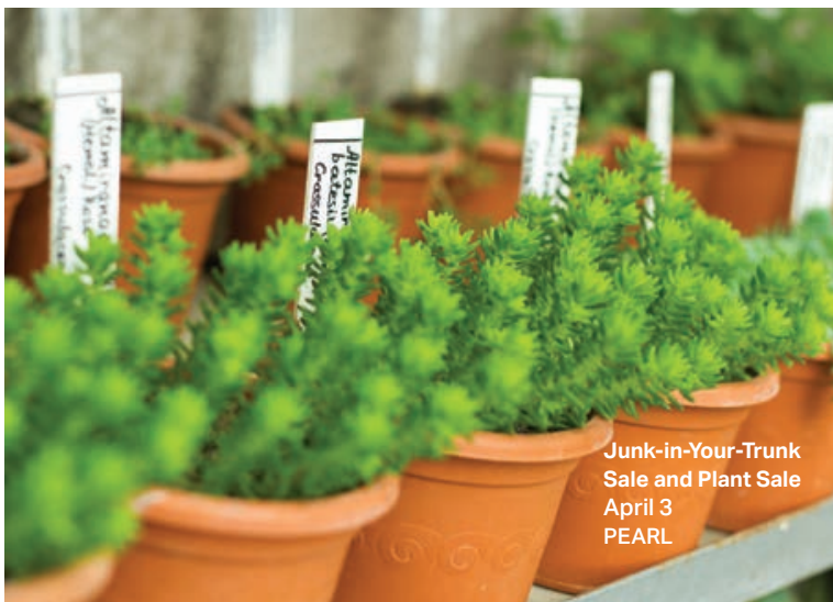
Junk-in-Your-Trunk Sale and Plant Sale April 3 PEARL