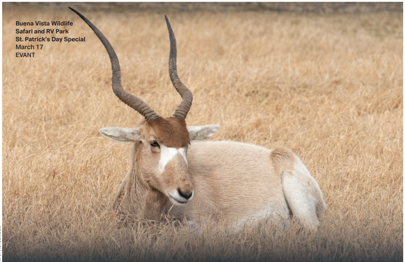
Buena Vista Wildlife Safari and RV Park St. Patrick's Day Special March 17 EVANT

Hico merchants celebrate spring with refreshments, discounts and door prizes.